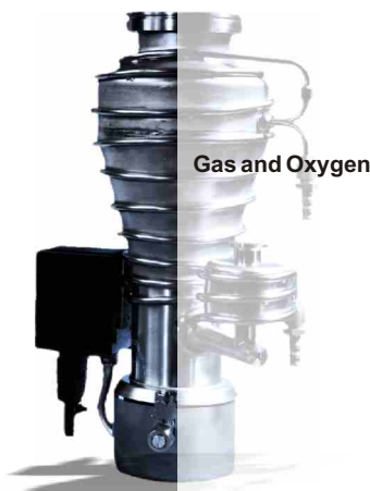
Gas and Oxygen